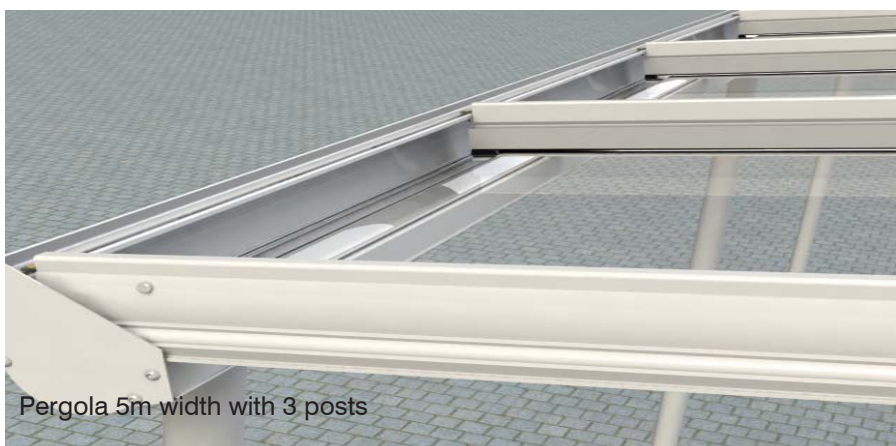
Pergola 5m width with 3 posts