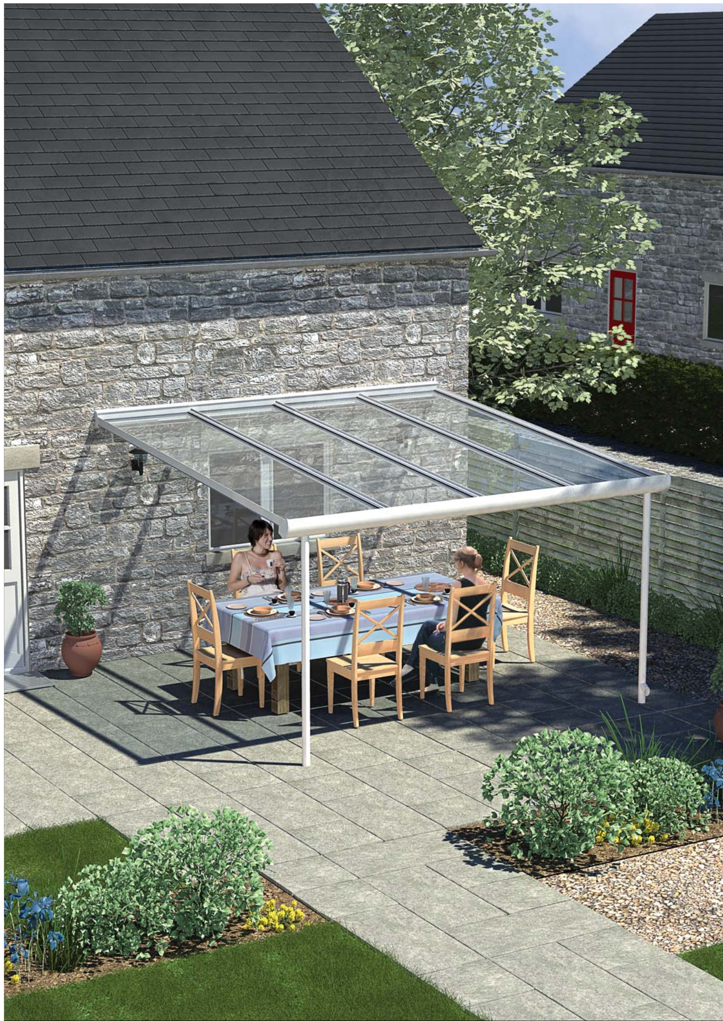
A width of 4m can be achieved with only 2 x posts due to the fact that they are offset 200mm from each end of the cap or Pergola beam