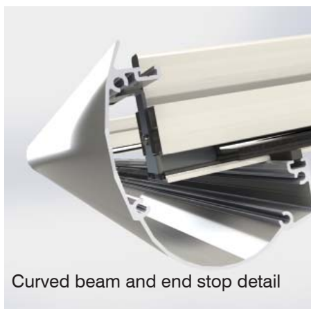
Curved beam and end stop detail