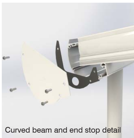
Curved beam and end stop detail