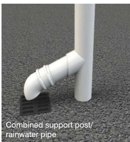
Combined support post/ rainwater pipe