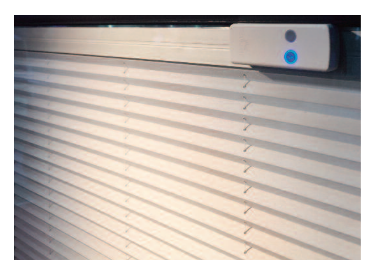
Motorised Colour Options