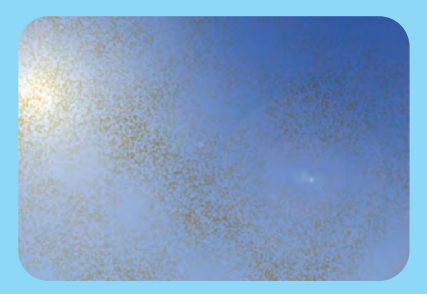
1. The window is exposed to daylight.