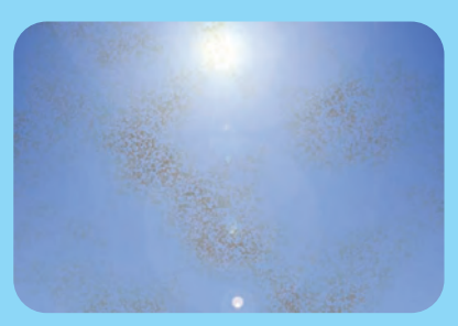
2. Daylight triggers the Pilkington \mathbf{Activ}^{\text{\tiny DM}} coating.