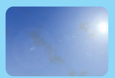
3. Reaction loosens organic dirt.