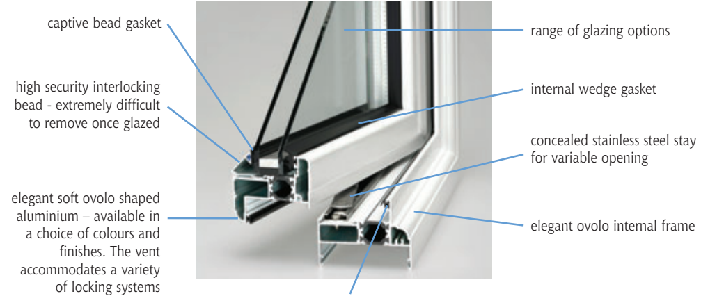
high performance weather stripping prevents air and water ingress