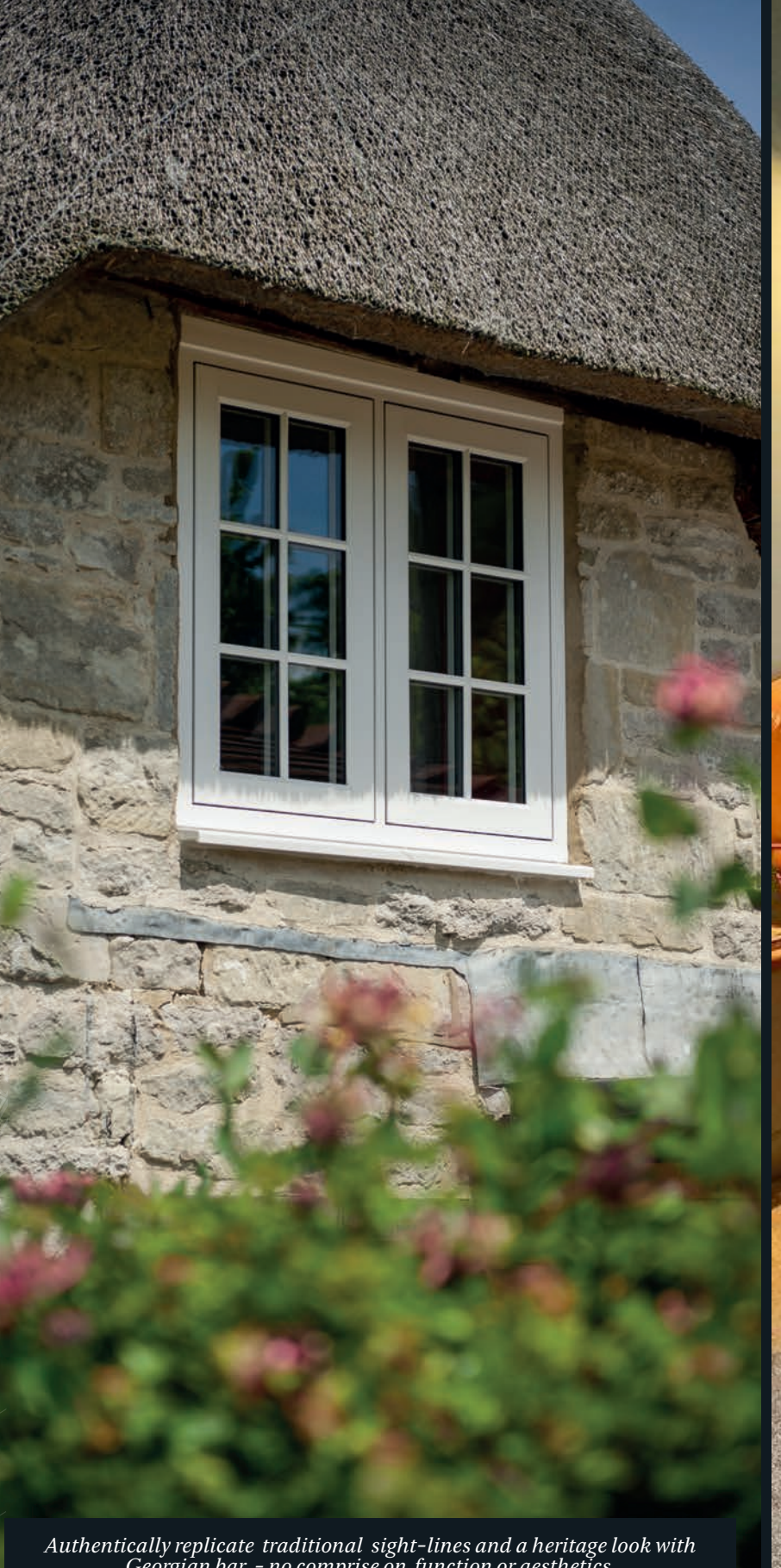
Georgian bar - no comprise on function or aesthetics.

For most homeowners, the style of their property will inform the design choices they make, so if you live in a Conservation Area Residence 9 can help enhance both appearance and performance, we have proven experience in helping to restore the original character of properties in hundreds of Conservation Areas, always with an eye to any planning considerations. We have also been approved in a number of Grade II Listed properties. If you are in a location with more design freedom R9 can help bring your ideas to life, balancing design and practicality to enhance your home, whilst still maintaining traditional looks.